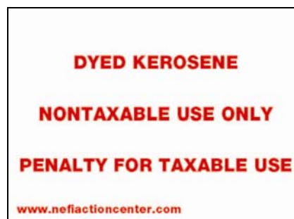
For Dyed Kerosene (#IRS-DK)